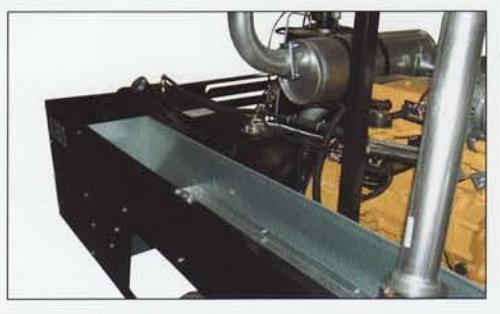
Sullivan-Palatek Portable Features:

Galvaneal Enclosure, protection against chipping and rust. Complete instrument panel.