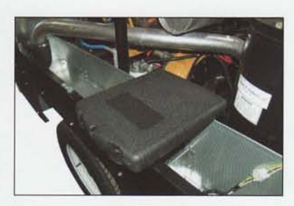
Manual Holder (optional) Equipped with Operating Manual Holder

Optional Panel: The optional panel consists of standard panel plus air oil separator indicator, tachometer, air filter indicator, fuel solenoid circuit breaker and starter breaker switches, discharge air temperature, voltmeter gauge, and ether starting.