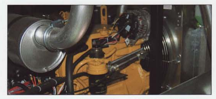
Sullivan-Palatek provides a THREE YEAR , Unlimited Hour, Air End Warranty, on all machines.